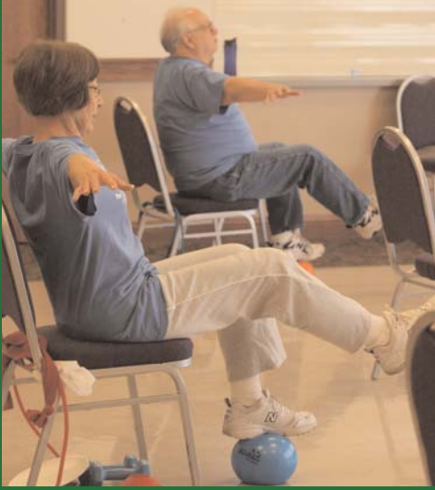
SilverSneakers continued from cover...

SilverSneakers fitness classes aren't just about exercising the body, many of the classes force participants to stimulate their brain as well. During her classes, Kopacek makes students like Roger count backwards while they exercise, or count in different languages, like Chinese, French or Spanish.