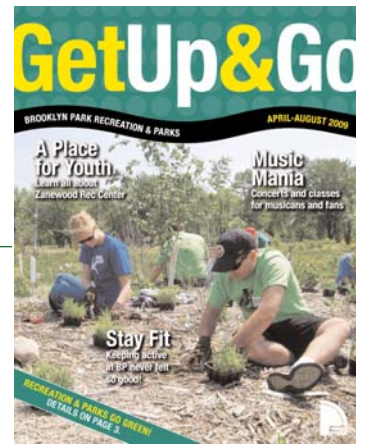
The new "GetUp&Go" summer recreation brochure is available and can be picked up at City Hall or the Community Activity Center

The Brooklyn Park Recreation and Parks Department offers a wide variety of recreational activities for all ages. Youth scholarships are available for enrolling in children's programming. Call 763-493-8333 to inquire about classes or pick up a brochure at the Community Activity Center or City Hall. You can also go online at www.brooklynpark.org to get more detailed information and register.